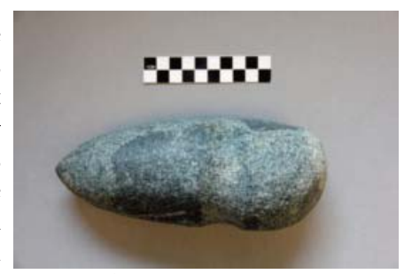
3/4 groove stone pick