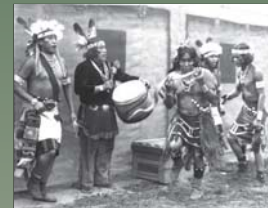
The Billingsley Faction

Tickets are $10 -- children under 12 are free